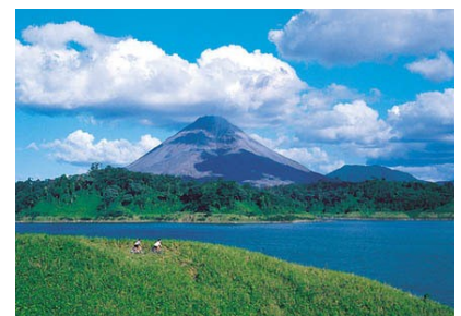
Capture the loveliness of the landscape

fore we think that one way or another you will be all right with them. We recommend that you bring some pictures with you of your family or your parish communities. This is a nice way to get a conversation going.