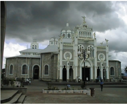
Visit important places of worship like the Basilica of Our Lady of the Angels in Cartago.