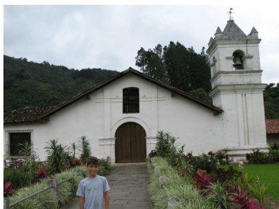
Costa Rica: Between culture and faith.