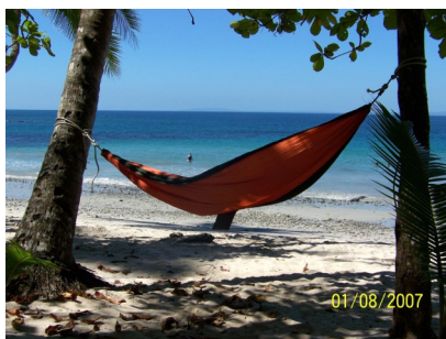
Costa Rica, a place to recharge batteries.

Mobile: (915) 539-3534 Email: pura.vida.course@gmail.com