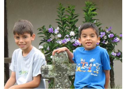
Meet the people

During the week we have also planned several outings to important landmarks such as the Cathedral, the Shrine to Our Lady of the Angels and other places which will provide a better perspective of Costa Rica's culture. We are still working on the schedule but we will inform you when things are ready to roll.