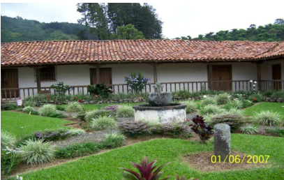
Admire the heritage of colonial times.