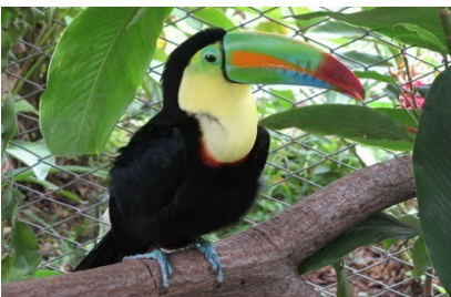
Costa Rica is well known for its flora and fauna.