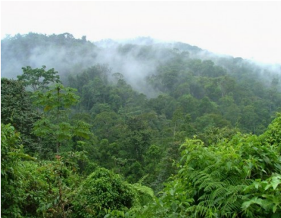
Experience the beauty of the Rain Forest.