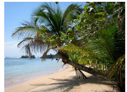
Take time to wonder